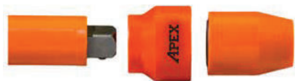
Gap Cover showing connection between the extension and socket.