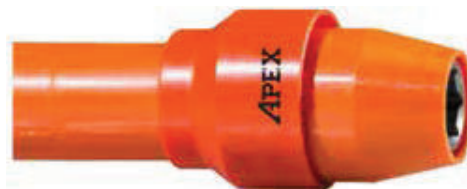
Tool with Gap Cover connection