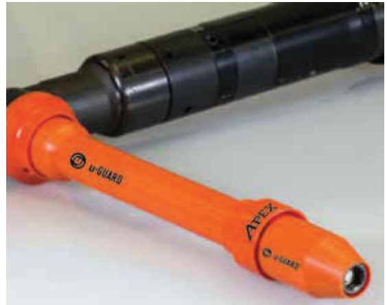
APEX u-GUARD gap cover enhances safety by covering the gap between a socket and an extension